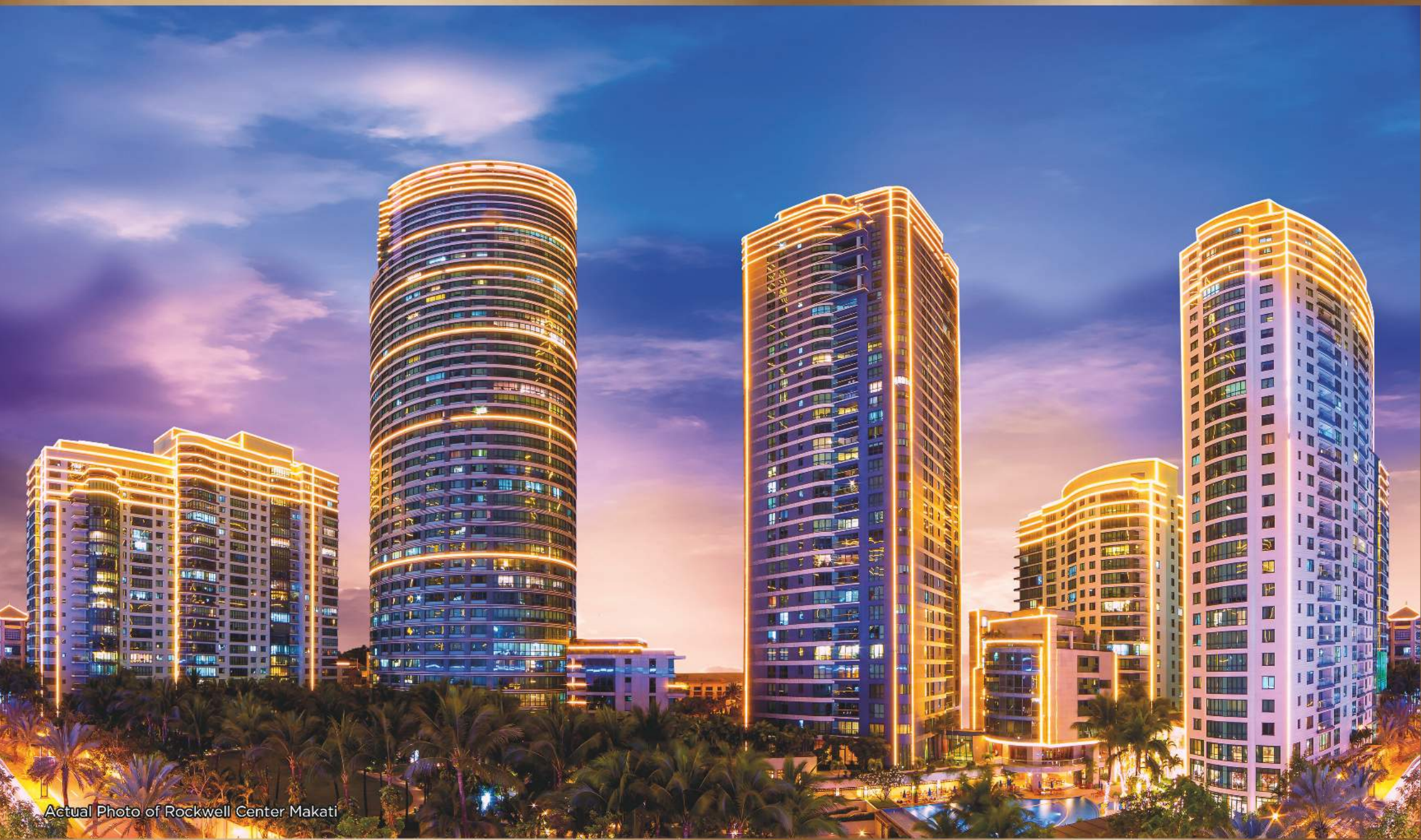
Actual Photo of Rockwell Center Makati