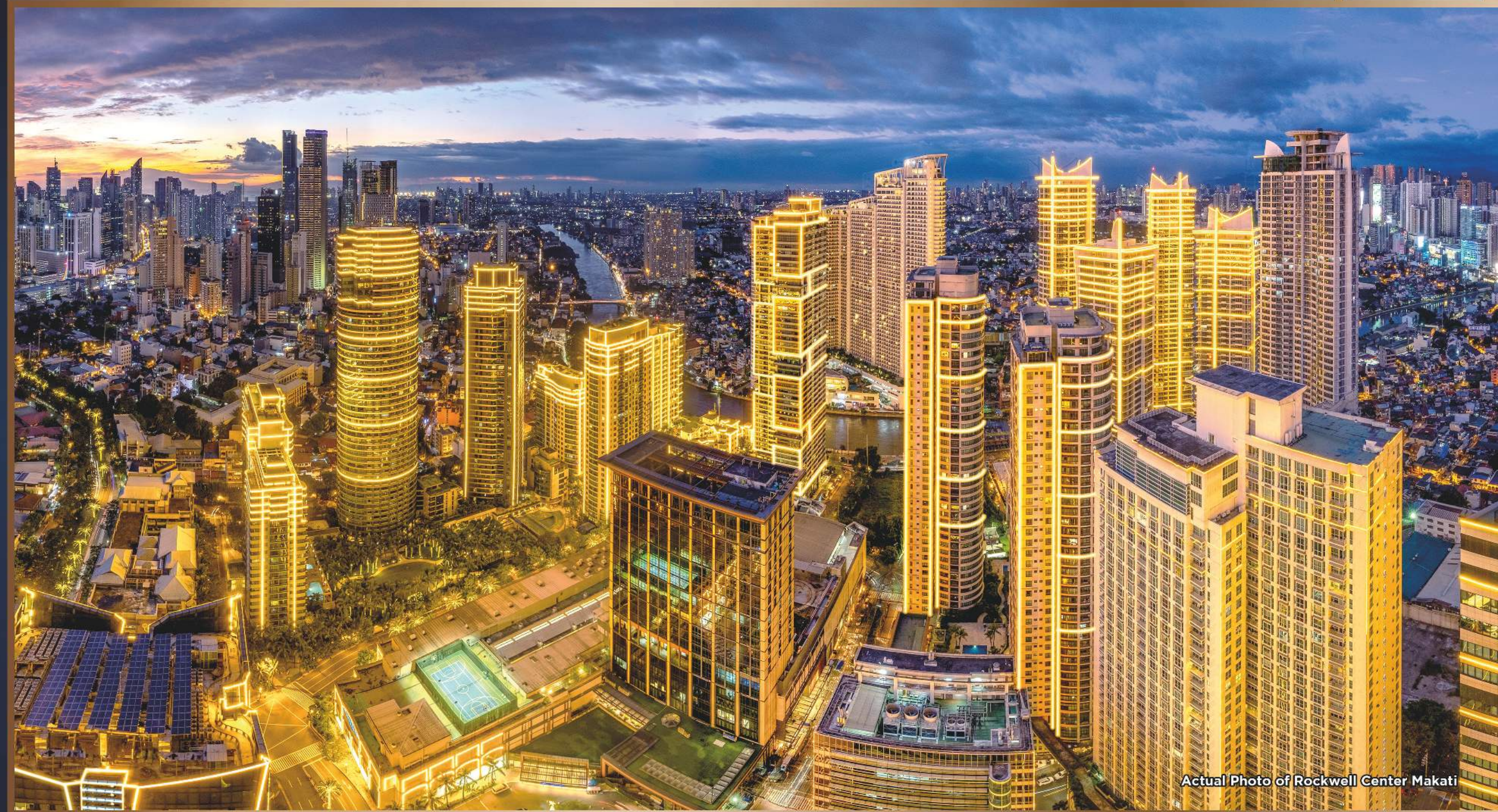
Actual Photo of Rockwell Center Makati

The city's finest call Rockwell Center Makati home, where business, retail, leisure, and community coalesce into this singular icon of urban living.