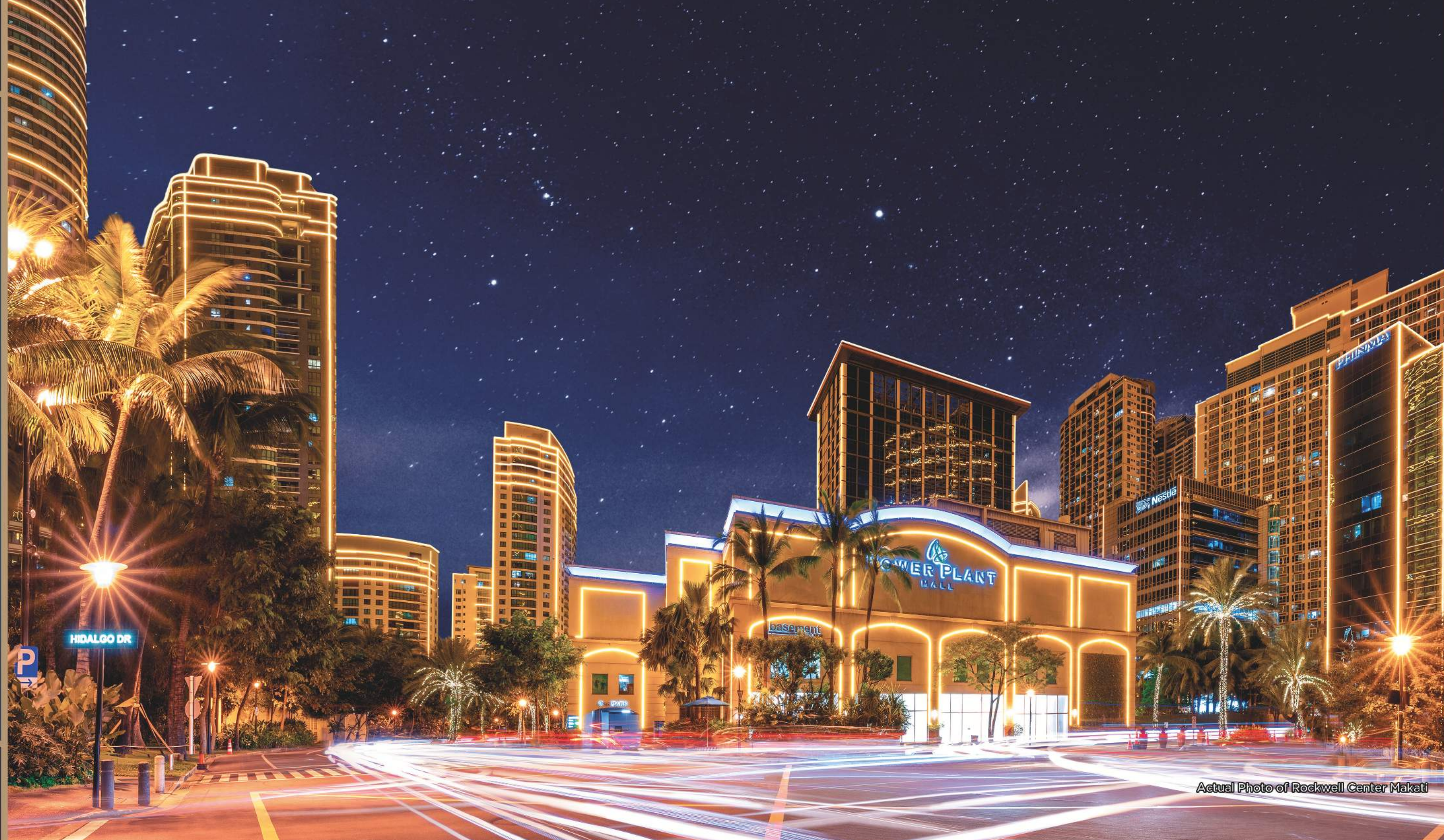
Actual Photo of Rockwell Center Makati

Be surrounded by the latest in fine dining and curated retail in the neighborhood that awaits. Every experience found at this Rockwell Center is crafted with our signature touch, creating a community that is as safe and comfortable as it is bustling with life.